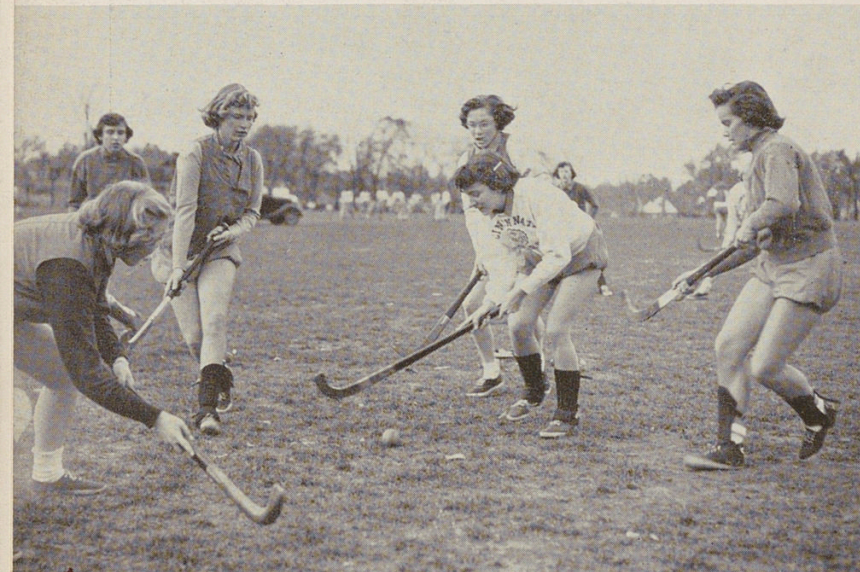
Girls sports make up a major part of curriculum.