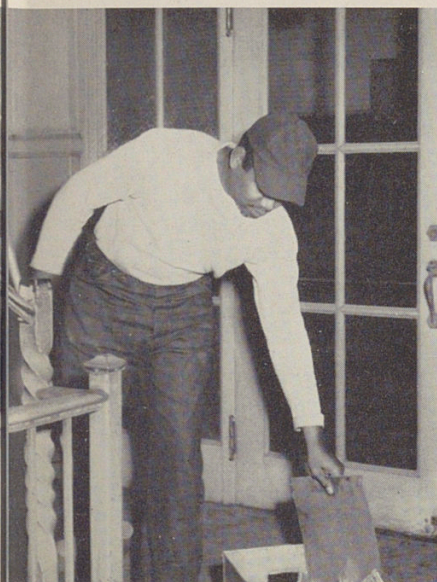
Don't mottos mean anything?