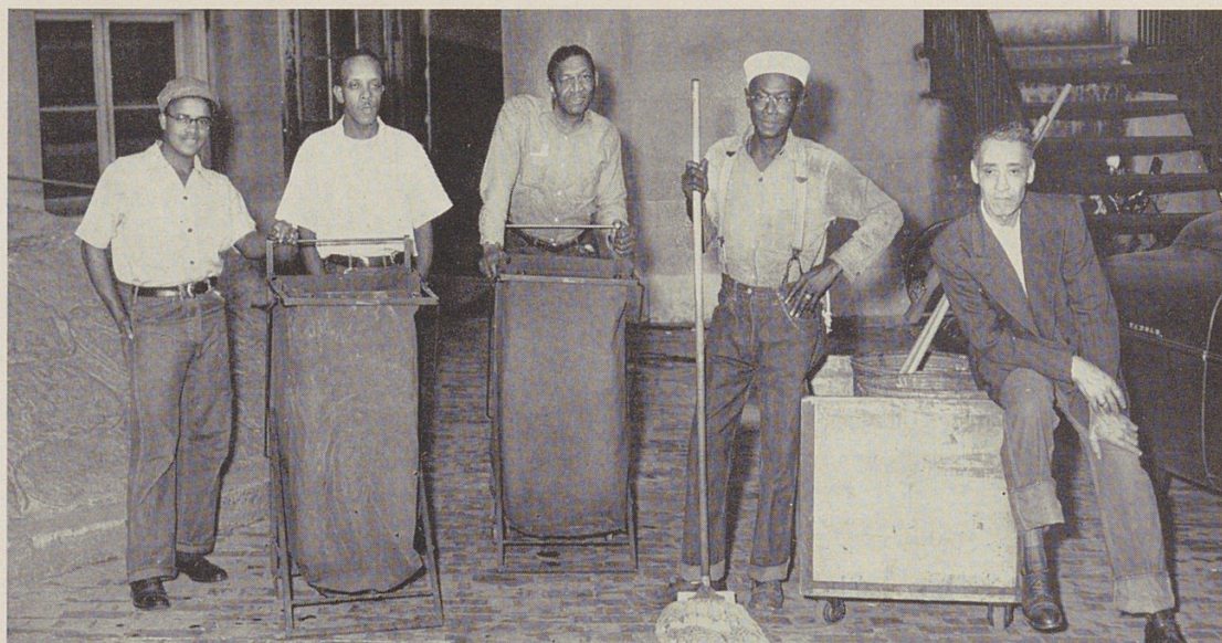
With our brooms and mops and little carts we work the whole day through.