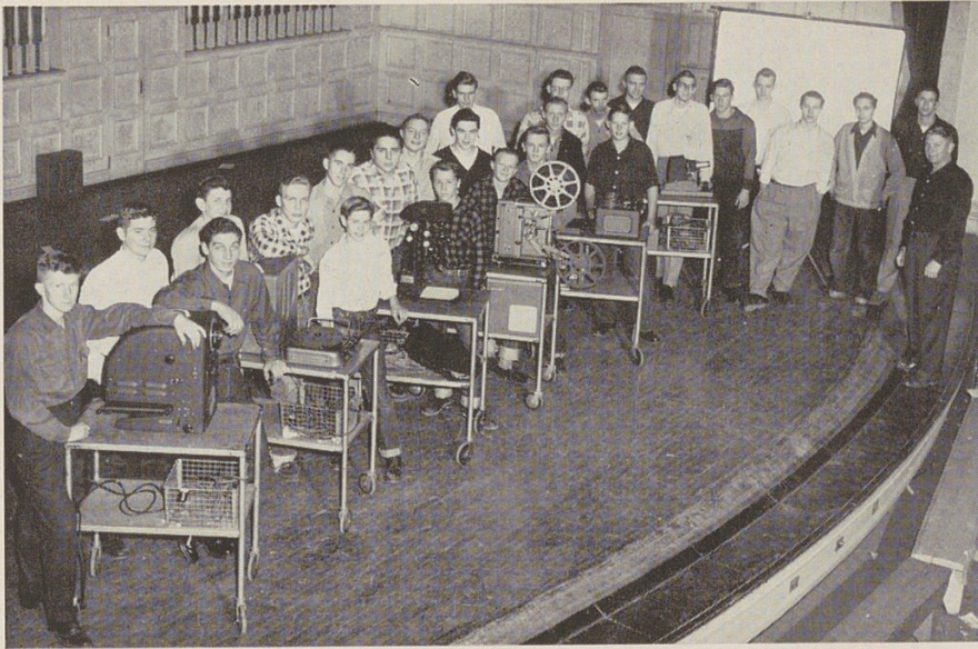
Films slides—all in a day's work for the projection crew.