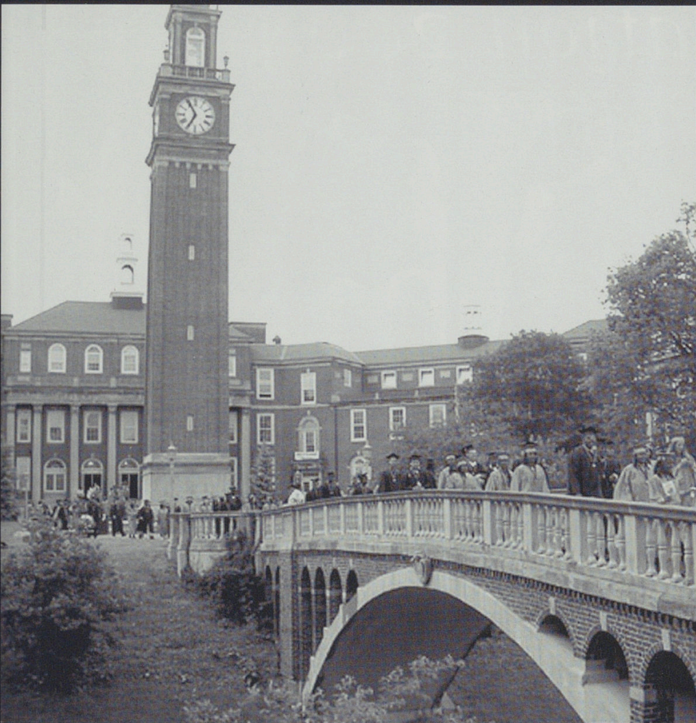
Below: Jamaal Spivery followed by the remainder of the class of 2004 (left) taking their last trip across the Withrow bridge as Withrow students.