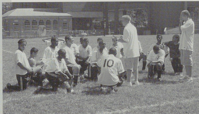
Coaches deliver apre-gamespeechon Withrow's home field.