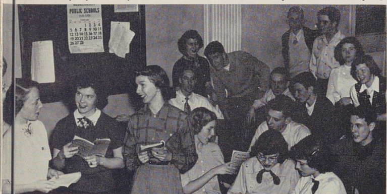
Who knows? Maybe Thalian will yield a Katherine Cornell.