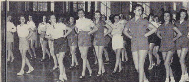
With every high kick, high hopes are dimmed a little.