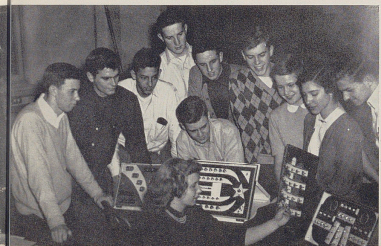
Junior Council makes its final decision on rings.