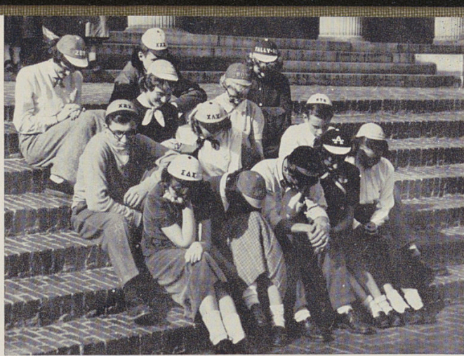
Some manufacturer's bright ideas are paying off. I guess we all follow fads!