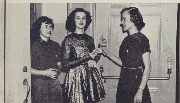
"There's no business like show business." Ask the Minstreleers.