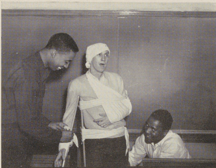
First Aid? "They were supposed to save me!"