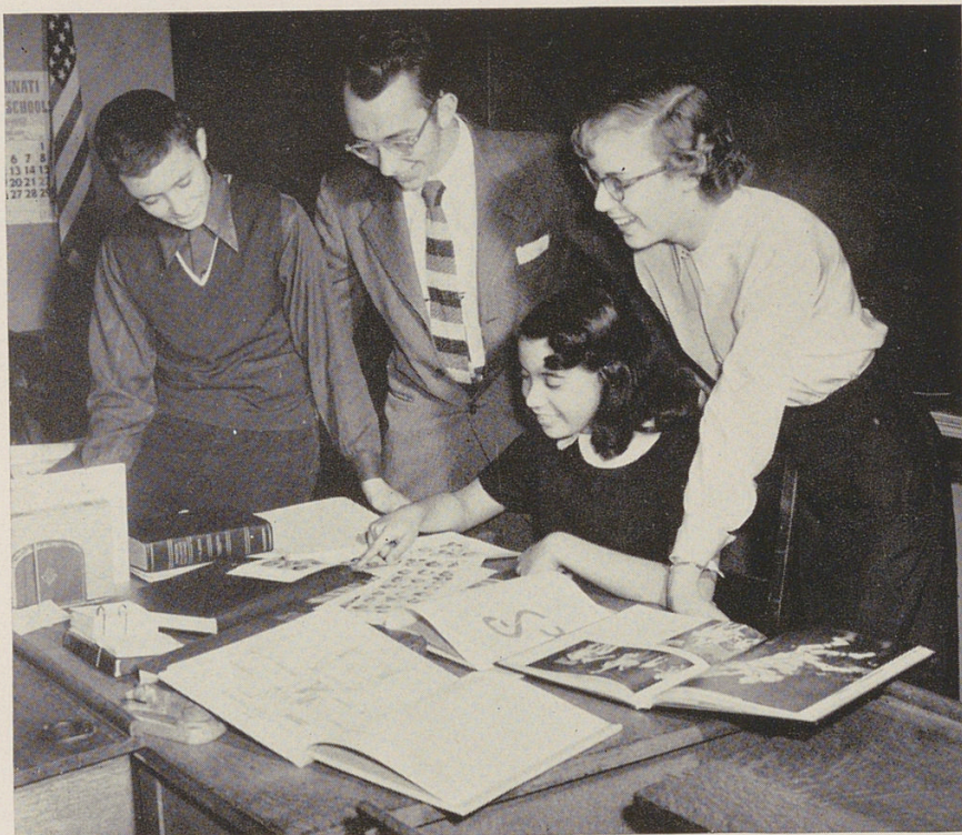
The executive staff in session.