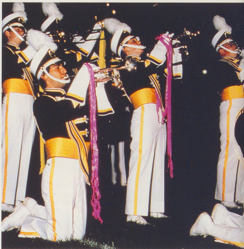
The Sycamore marching band performs the spectacular half-time show during the Homecoming game.