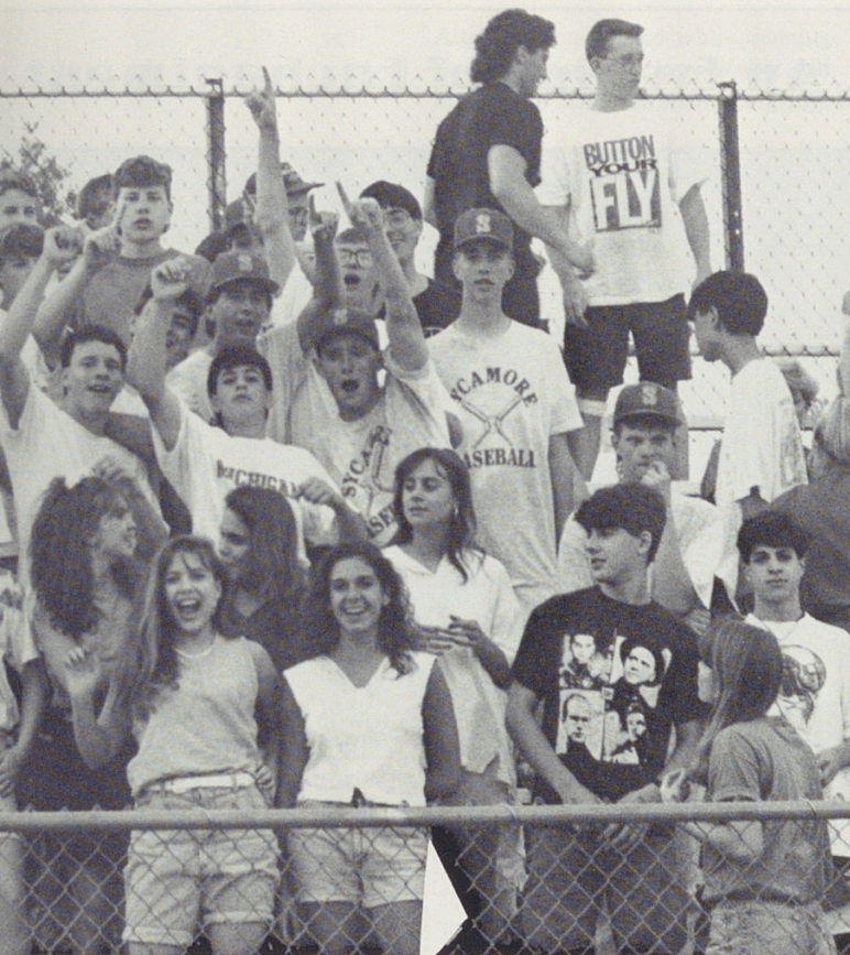
Waiting for the powder puff game to begin are loads of Sycamore students in the soccer bleachers!