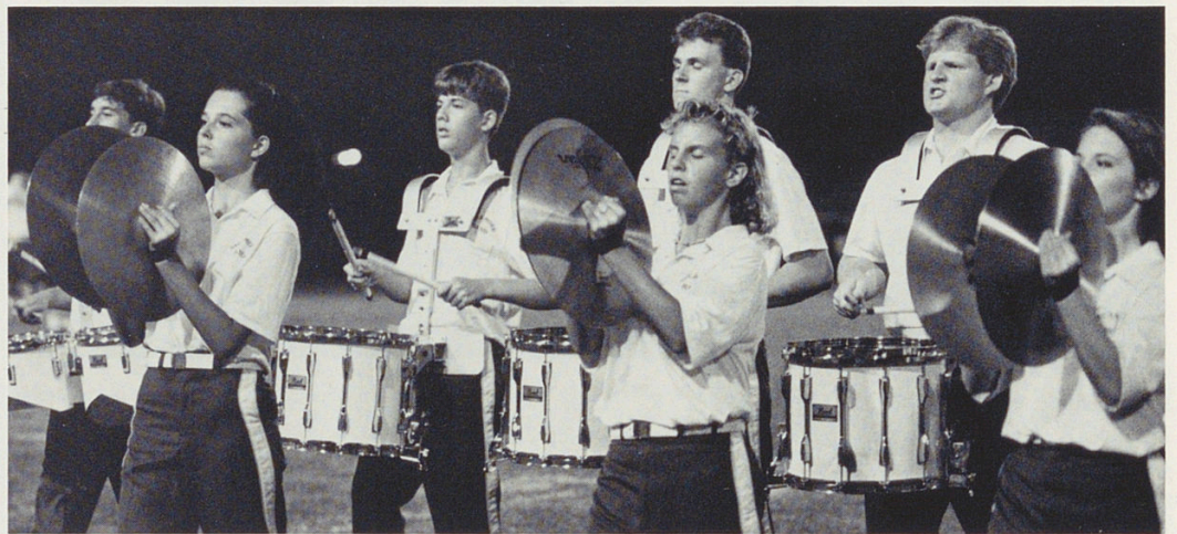
The Drum Line counts their steps as they march and play the halftime show.