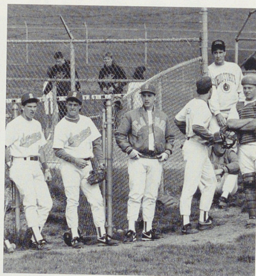
Just hanging out...The varsity boys take a breather and follow the game until it is their turn to bat.