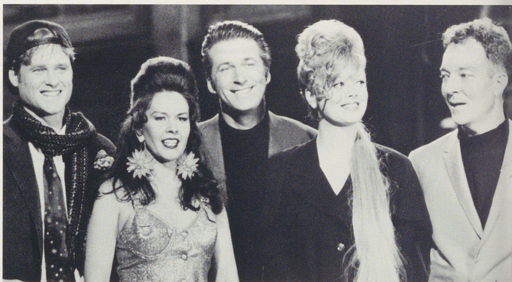
With their goofy dance music and 60's styles, the B-52's made a comeback this year after a few year absence from the music world. Their album, "Cosmic Thing," was a hit and reached triple platinum.