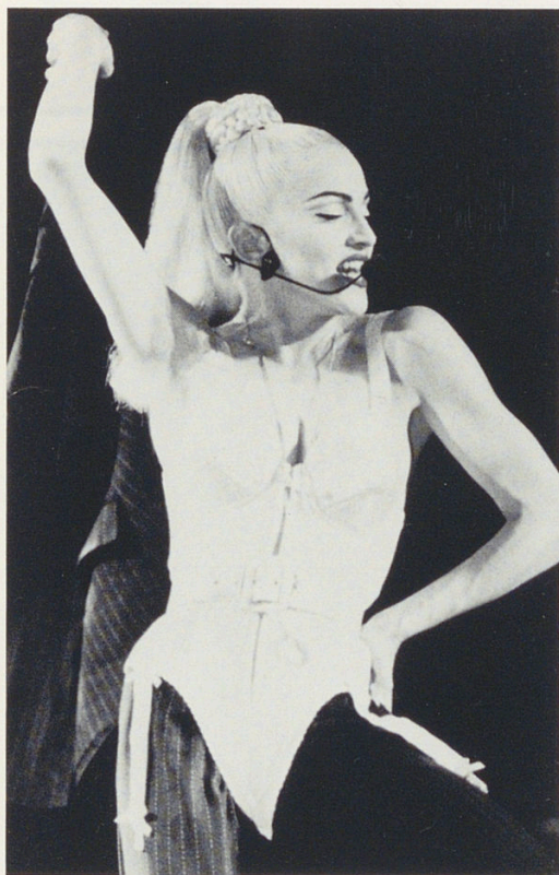
From "Borderline" to "Justify My Love," Madonna has shown what she's got.