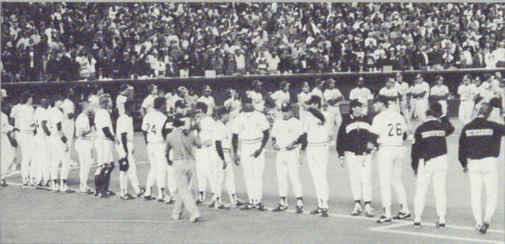
Surrounded by thousands of loyal fans, the World Champion Reds await the start of a World Series Game against the Oakland A's.