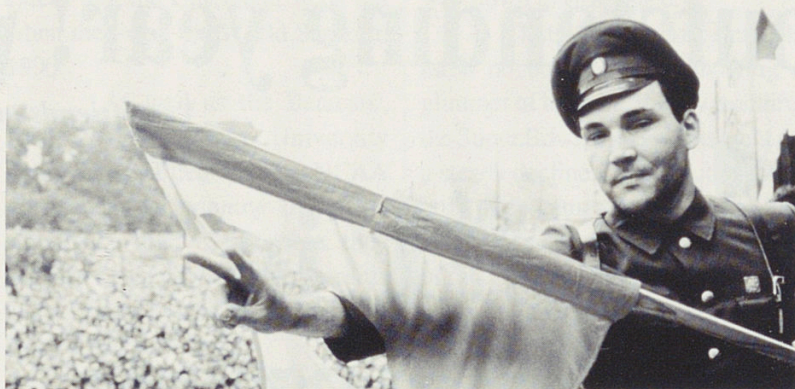
At a gathering to protest the coup of Gorbachev, a Russian soldier shows his people that the hammer and sickle no longer are the symbols of peace.