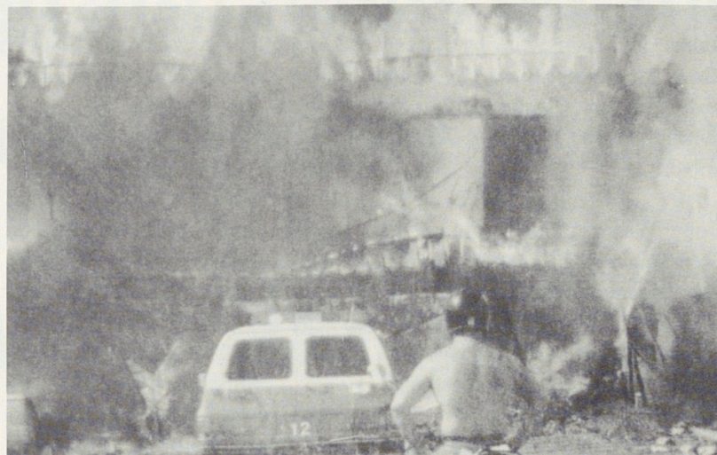
A fire rages in Los Angeles as protest to the so-called racist verdict in the Rodney King trial. As one of the many, it stands here untouched.