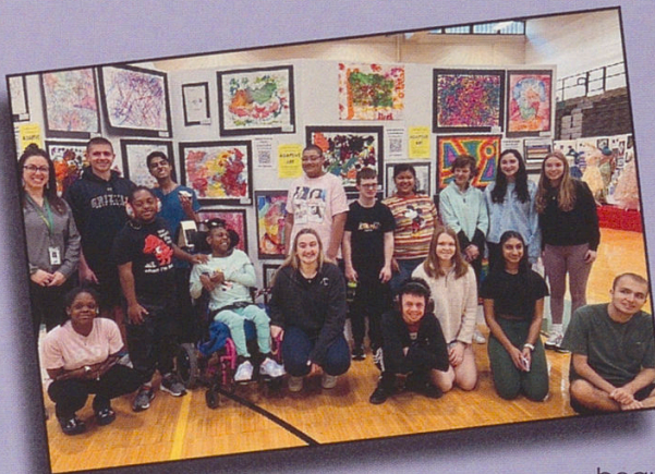
Adaptive Art Class