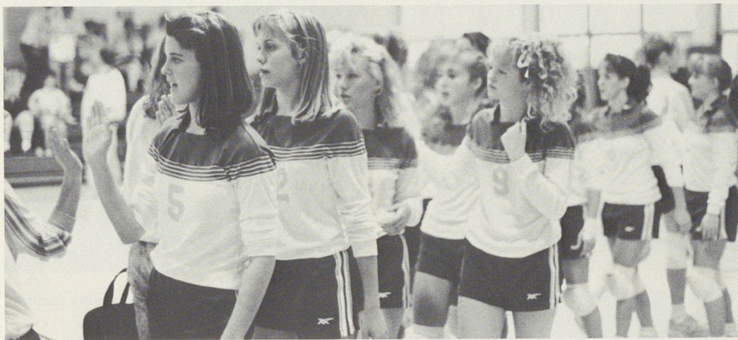
The JV team shows their good sportsmanship by shaking hands with the opposing team.