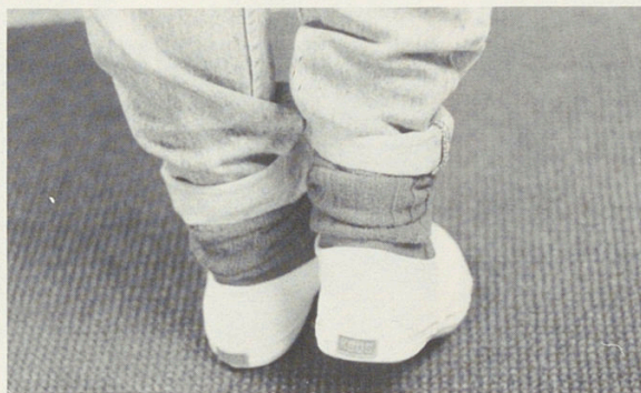
From the 60's to the 90's Keds sneakers will never be outdated.

Commonly idolized by the young generation, the general high school consensus remains that the New Kids are out.