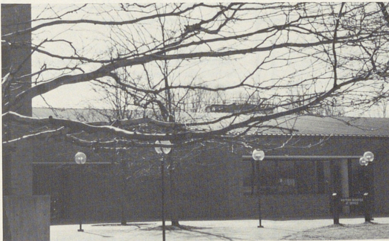
The present high school on Cornell Road was built in 1974.

Our Service Is Free But ... Our Advice Is Priceless