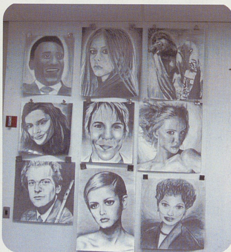
There is talent all around. Mr. Inwood's Art II students used the grid method to draw portraits of someone of their choice. The drawings included artists, musicians, and friends.