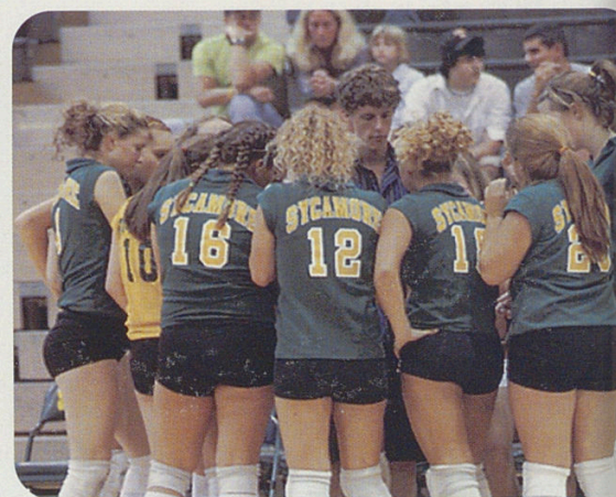
The JV team is huddling and giving advice to one another before one of its matches. Win or lose, the team is always told to persevere and show consistent effort and support for each other. Clearly, the team has followed their coach's advice as well as their own.