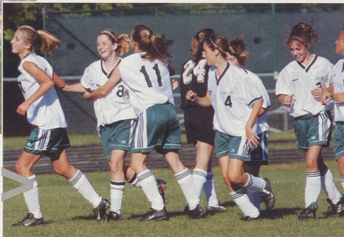
VICTORY. The girls gold team ran off the field after winning one of their games. Although the scoreboard may not have reflected a winning season, the girls won at making new friends and perfecting their skills for the next season.