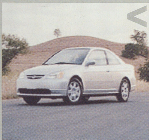
THE HONDA CIVIC WAS ONE OF THE MOST COMMONLY DRIVEN CARS for teenagers along with the Honda Accord, as were various types of Toyotas and the Volkswagon Jetta and Passat. The 'lower' price along with great safety ratings and good 'wear and tear' value, made these cars among the most seen in the student parking lot. These cars cost anywhere from $13,270 - $21,820 new, to $9,000-$14,000 used.