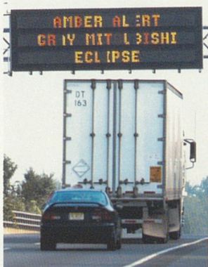
The "Protect Act of 2003" urges states to administer the Amber Alert system.