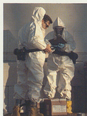
Three capitol buildings close for cleanup when ricin is found in Senate Majority Leader Bill Frist's mailroom.