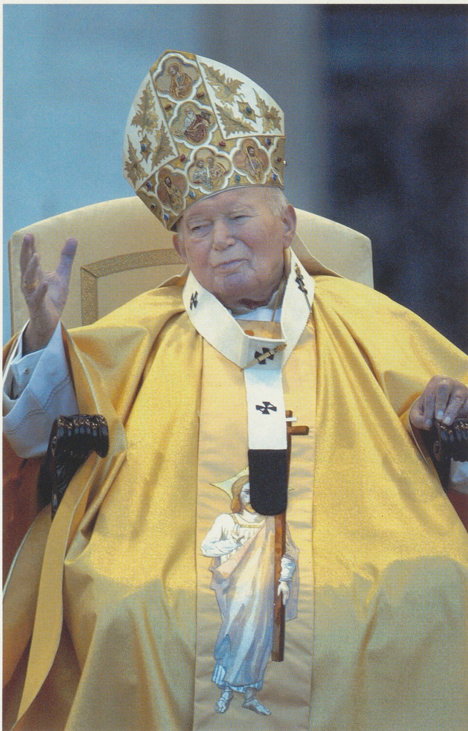
Pope John Paul II celebrates his 25th anniversary as pope. Despite the debilitating affects of Parkinson's disease the 83-year-old pontiff presided over an anniversary Mass that drew tens of thousands of people to St. Peter's Square, Vatican City.