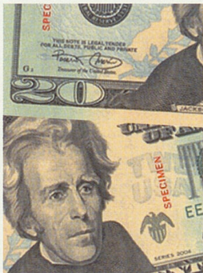
The United States Federal Reserve enters a colorful $20 bill into circulation.