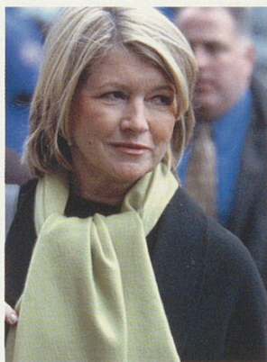
Martha Stewart is convicted on multiple charges related to her sale of ImClone stock.