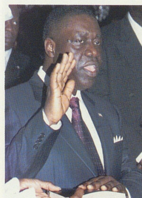
Gyude Bryant becomes the leader of Liberia's postwar government. Former leader Charles Taylor was exiled.