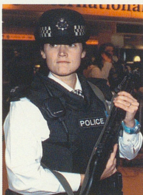
The Homeland Security Department requires armed law enforcement officers on certain international flights.