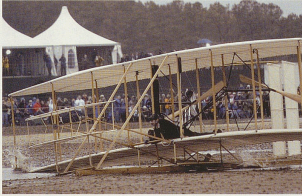
Kill Devil Hills, NC celebrates the 100th anniversary of the Wright Brother's first manned and powered flight. Attempts to re-enact the flight failed because of unfavorable conditions.