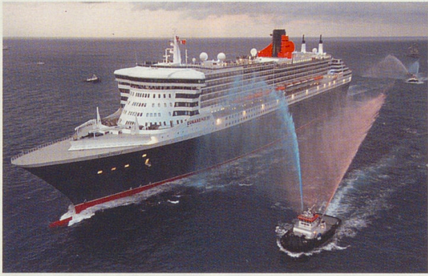
Measuring 1,132 feet long, 236 feet high and valued at $800 million, the Queen Mary II is the world's largest and most expensive passenger ship.