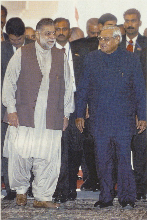
Following two years of opposition, Pakistan's President Pervez Musharraf and Indian Foreign Minister Yashwant Sinha agree to engage in dialogues aimed at resolving their long-term dispute over the Kashmir region.