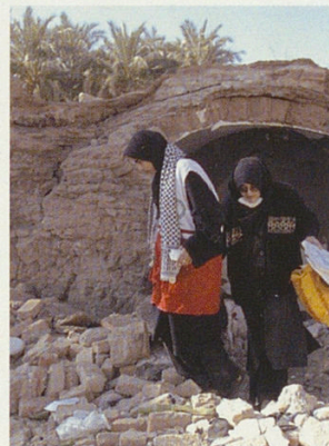
More than 28,000 people die when a magnitude 6.6 earthquake rocks Bam, Iran.