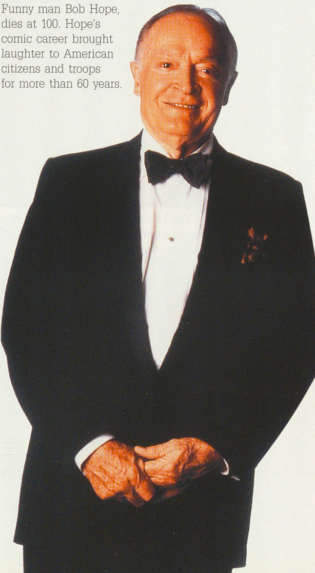
Funny man Bob Hope, dies at 100. Hope's comic career brought laughter to American citizens and troops for more than 60 years.