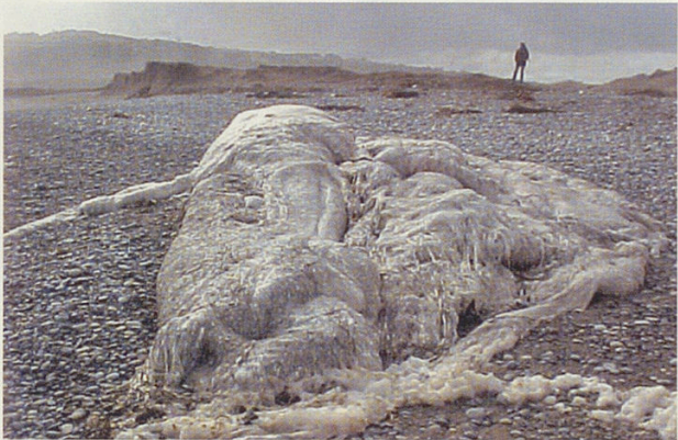
Scientists debate whether a 40-foot wide, gelatinous sea specimen found on the coast of Chile is decomposing whale tissue or part of the rare Octopus Giganteus.