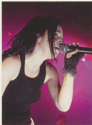
The Grammy for Best New Artist goes to rock group Evanescence.