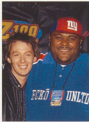
Ruben Studdard outsings Clay Aiken, becoming the second American Idol.