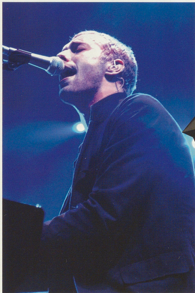
Coldplay receives three MTV Music Awards and their single "Clocks" is named Record of the Year at the Grammy Awards. Lead singer Chris Martin married actress and mom-to-be Gwyneth Paltrow.