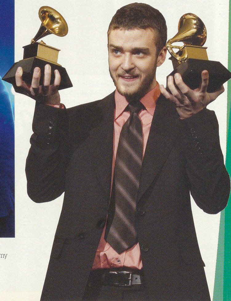
Justin Timberlake's album "Justified" is awarded two Grammys for Best Pop Vocal Album and Best Male Pop Vocal Performance. Justin also won an American Music Award for Favorite Album-Pop or Rock and three Video Music Awards.

• While touring in Europe heavy Metal singer Ozzy Osbourne was seriously injured in an ATV accident.