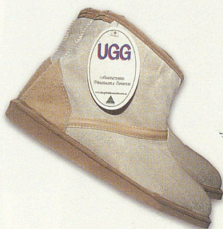
Thick-soled and fur-lined Ugg boots stomp their way to Hollywood fashion to everyday footwear.