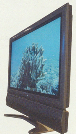
High definition, flat screen televisions and DVD recorders are the new wave in home entertainment.