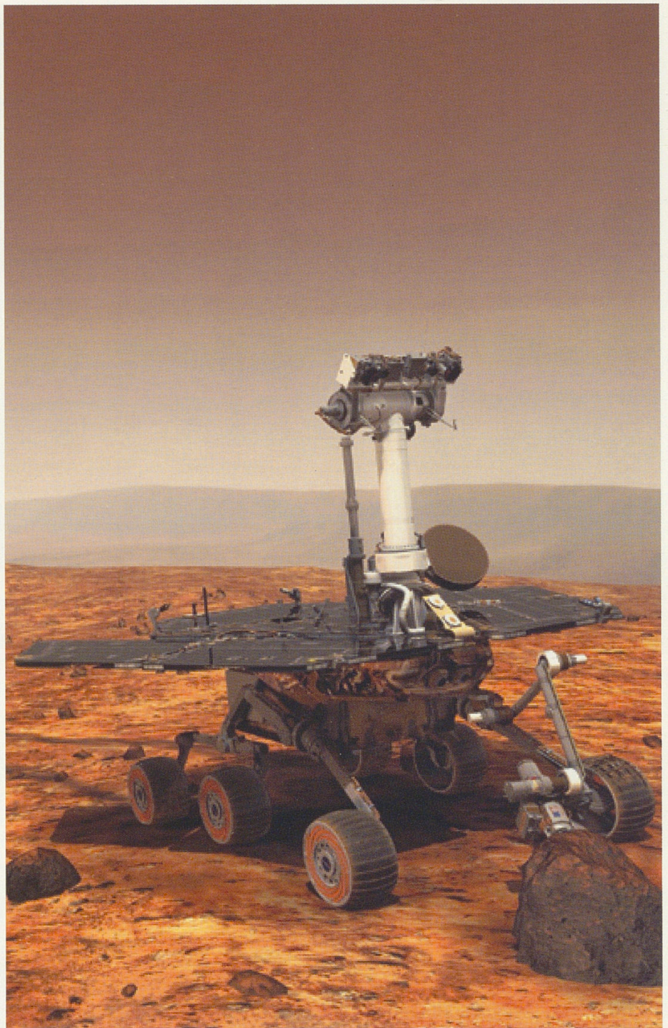
The United States' second Mars rover, Spirit, explores the Red Planet's terrain. Following 10 days of lost contact, Spirit continued to collect data, dig for soil samples and set a one-day distance record of 70 feet.