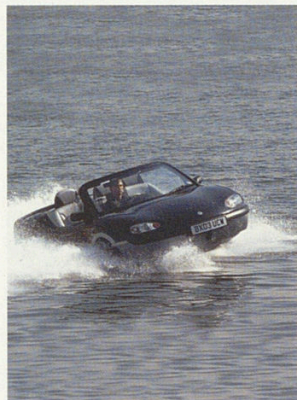
The Aquada, a new boat/car, can travel up to 30 mph in the water.