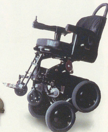
Physically handicapped people can now travel virtually anywhere in the Independence iBOT 3000.