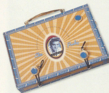
Carryalls take on a fresh new look with beaded handbags, mesh backpacks and vintage cigar box purses.