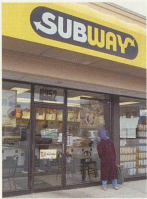
Fast-food menus change to accommodate the rising number of low-carb dieters.