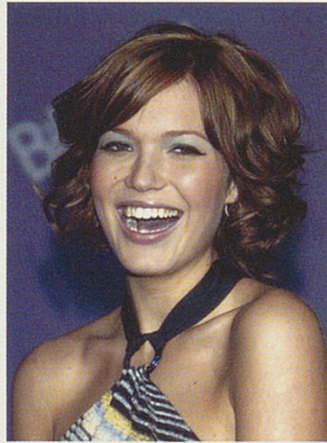
Mandy Moore wears cute "girl curls" while guys sport shaggy cuts and close shaves.