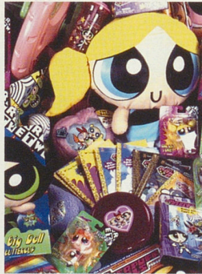
Powerpuff Girls, Hello Kitty and Curious George are popular cartoon characters.