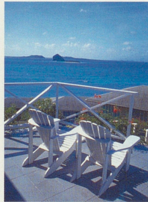
Online booking companies such as Orbitz and Expedia hurt travel agency sales.