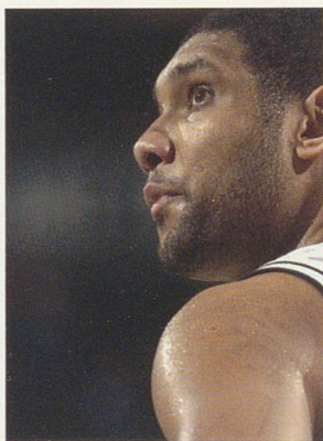
League MVP Tim Duncan leads the San Antonio Spurs to the NBA championship.