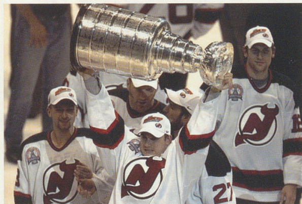
The New Jersey Devils earn their third Stanley Cup in nine seasons after defeating the Anaheim Mighty Ducks 4-3 in the seven game series.