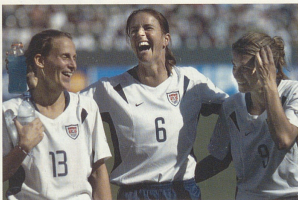
Kristine Lilly, Brandi Chastain and Mia Hamm celebrate a 3-1 U.S. victory over Canada in the FIFA Women's World Cup. The win earned the United States a Bronze Medal.