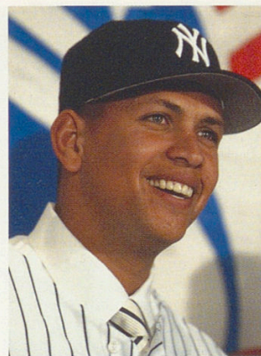
Alex Rodriguez signs with the New York Yankees and moves from shortstop to third base.