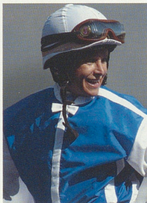
Julie Krone becomes the first female jockey to win a Breeders' Cup race.