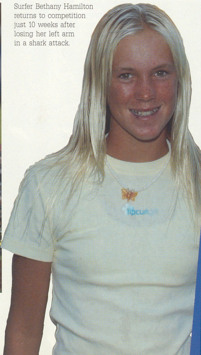
Surfer Bethany Hamilton returns to competition just 10 weeks after losing her left arm in a shark attack.