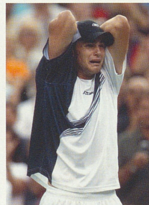
Andy Roddick defeats top-ranked Juan Carlos Ferrero in the U.S. Open Finals.