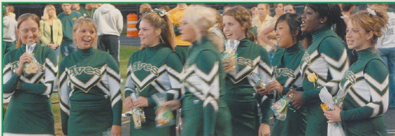
The girls anxiously await at the rose ceremony to find out which football players they will receive their roses from. The rose ceremony was one of the school's Homecoming traditions. Only the seniors received roses, but it was fun for everyone who watched.

After football season finished the girls took a few weeks off, then they had to work on new things for the upcoming basketball season.