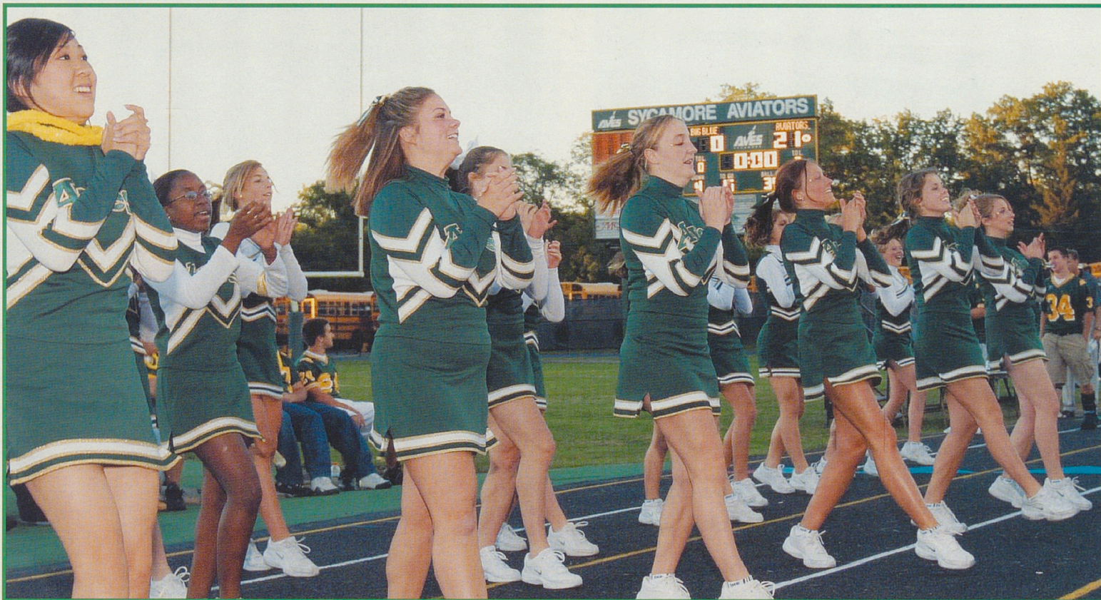
The cheerleaders pump up the crowd as they do the fight song. The girls did the fight song when the team scored or at the end of the games. On senior night the varsity girls cheered with JV and freshman, but they also had the help from some of much younger girls in elementary school.