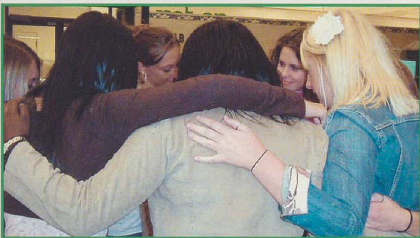
At the fall sports awards the girls choose to end the night with a team hug. It was an emotional night because some of the girls would not be coming back for the basketball season. Even though football season was over, most of the girls were thrilled about starting basketball season.