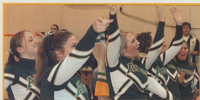
Let's hear it! The girls kept the crowd excited at one of the basketball games by doing cheers that everyone could chant to. The cheerleaders always knew the right chant or dance to do for the crowd so it would keep everyone excited.