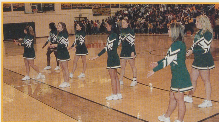
During halftime the team goes out on the court to do a chant. The team took every opportunity that they could to let their team know that they were proud of them, no matter what the score was. The squad never gave up on their team, and it always showed.