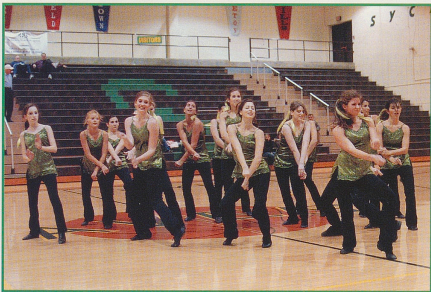
The Flyerettes perform their competition dance at a basketball game before they compete in Columbus. They wanted to make sure their moves are perfect and they were ready to dance! They performed to a Van Halen song that has been mixed with an upbeat tempo and numerous technical moves to make this one of the most exciting routines of the year.