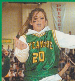
"We worked so hard this year and it definitely showed through our performances and especially our competition."