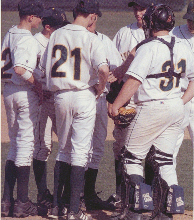
Huddle Up. The infielders met on the mound for a short pep-talk to help them finish the inning. The team support always was positive with this team.