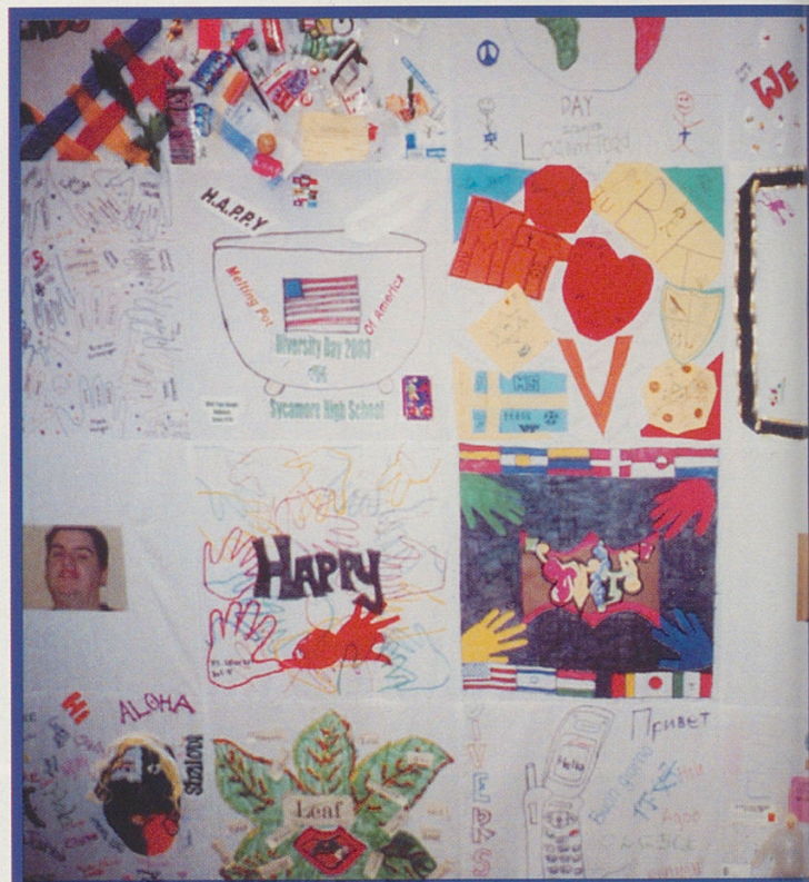
Melting together. During fifth bell every class made a square for a quilt. The object of each square was to be made up of items from the student's backpacks.

Everyone was drawn to the African dancers. They interacted with the students and asked for drummer and dancer volunteers. Students who saw them enjoyed their performance.