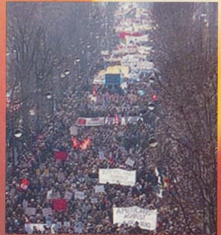
French police say 300,000 protesters marched throughout the country.