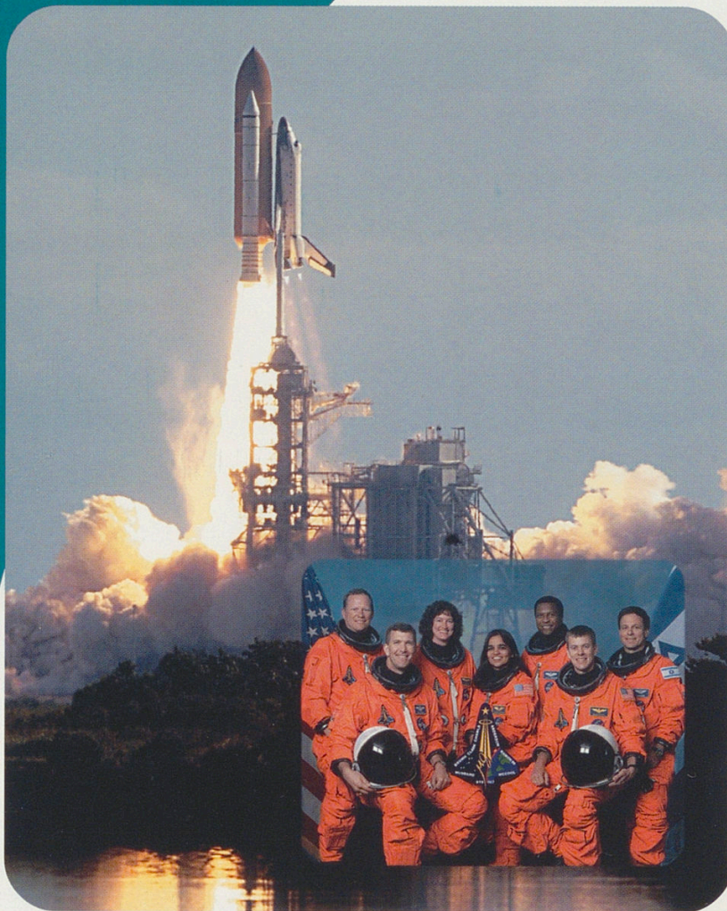
Upon re-entry into Earth's atmosphere, NASA's space shuttle Columbia loses contact with Mission Control in Houston and breaks apart in the skies over Texas. A crew of seven astronauts, including the first Israeli in space, perished.