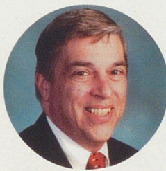
FBI agent Robert Hanssen receives life without parole for selling secrets to Russia.