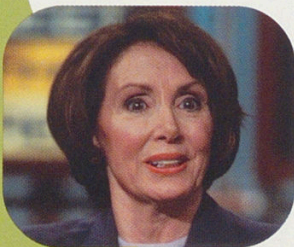
Rep. Nancy Pelosi becomes the first woman party leader in the House or Senate.