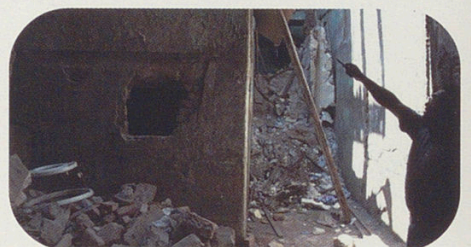
An earthquake measuring 7.8 magnitude rocks Colima, Mexico. Iran and Italy experienced major quakes measuring 6.3 and 5.9.