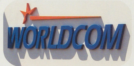
Because of improper accounting and a debt load of $41 billion, WorldCom files for Chapter 11 bankruptcy protection, the largest in U.S. history.