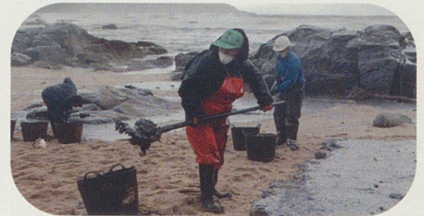
Bahamian oil tanker "Prestige," carrying 20 million gallons of oil, sinks off the coast of Spain. Nearly 2.6 million gallons of oil polluted the coast.