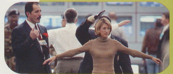
The Transportation Security Administration coordinates airport security measures including checked baggage screening, strict security checkpoints and random searches.