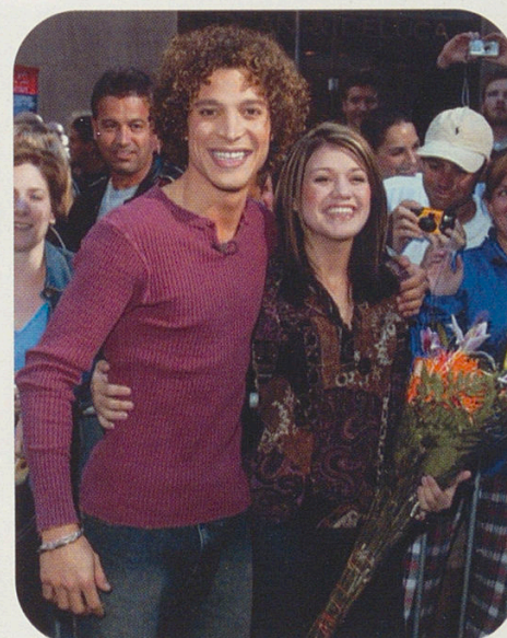
Kelly Clarkson beats out Justin Guarini to win her own record deal and become the first "American Idol."