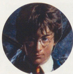
"Harry Potter and the Chamber of Secrets" earns more than $240 million.