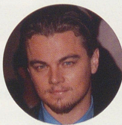
Leonardo DiCaprio shines in "Gangs of New York" and "Catch Me if You Can."