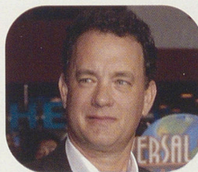
Actor Tom Hanks receives the Lifetime Achievement Award at the Golden Globe Awards.