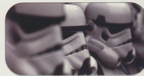
George Lucas's "Star Wars: Episode Two - Attack of the Clones" earns $310 million, making it 2002's No. 2 box office hit.