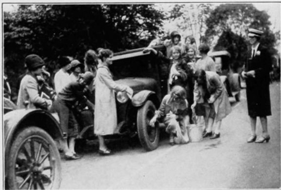
"CHIEF MOORE'S AUTO LAUNDRY"

The stern Vigilantes, ferreting out the younger members of our great University circle, know that only by means of severe discipline and actual manual labor can true education be attained. Consequently, the cars of many prominent campus people permanently lose that school-girl complexion.