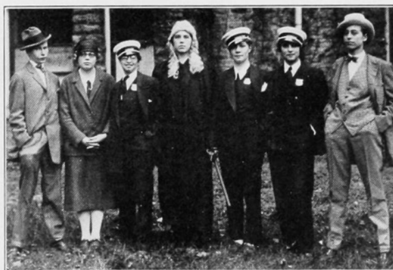
"IN THE NAME OF THE LAW"

Then comes a day when the Council of Six, in solemn array and in serious purpose, temporarily becomes a criminal court of high justice, to try and to pronounce justice upon the cases of malicious co-frosh offenders.