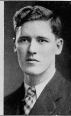
Dial, Half Back