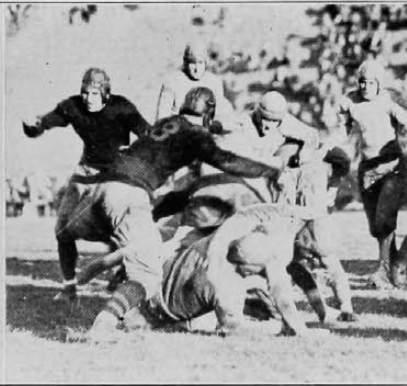
The Green is held