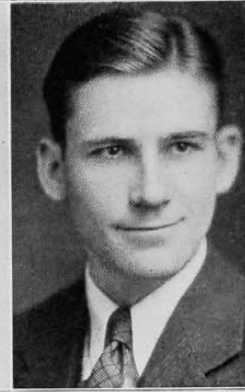
EARLY, Forward Captain-elect