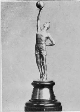
The Buckeye Cup.