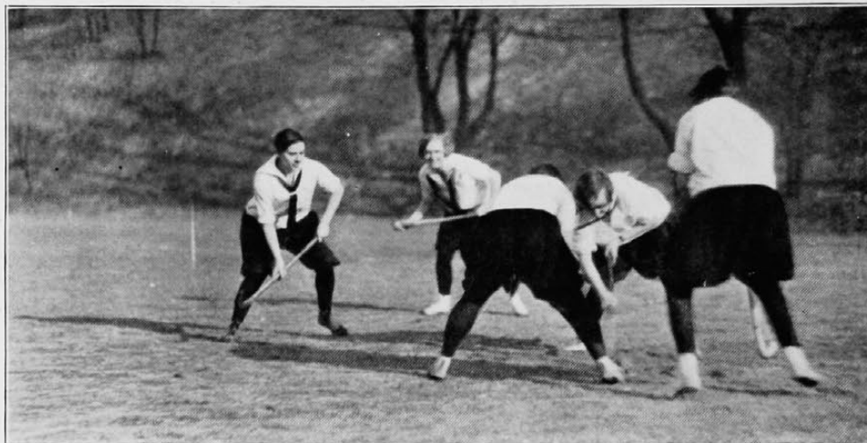
Fast Stick Work!