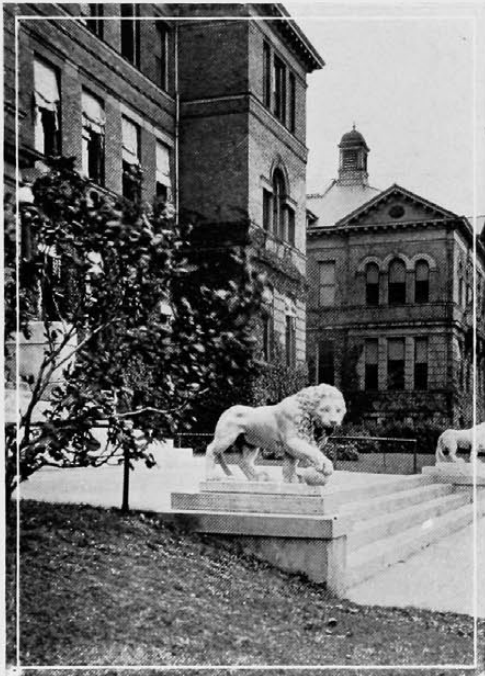
On the Steps of Old McMicken

S EPTEMBER is here and we climb the steps between the lions to old McMicken Hall. Each one is enthusiastic and ready to put forth every effort to make the school year a success.