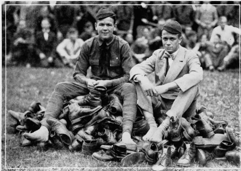
Take Your Choice

B UT wait! Isn't there just a little too much enthusiasm among the Freshmen? Shouldn't their "savoir faire" be shaken just a little? Yes, even their sympathetic brother Sophs think so; and so we institute a course in "swatology."