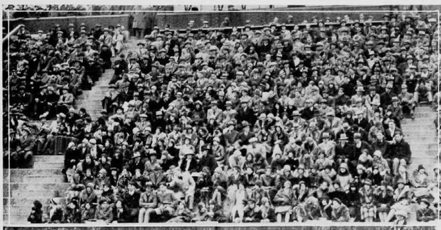
And We'll All Hang Together

W E all get the fever, and, for the present, forget fraternity quarrels and jealousies while joining together to root for Varsity. A fighting team, a peppy crowd, a warm blanket, and a hot dog—who could wish for more?