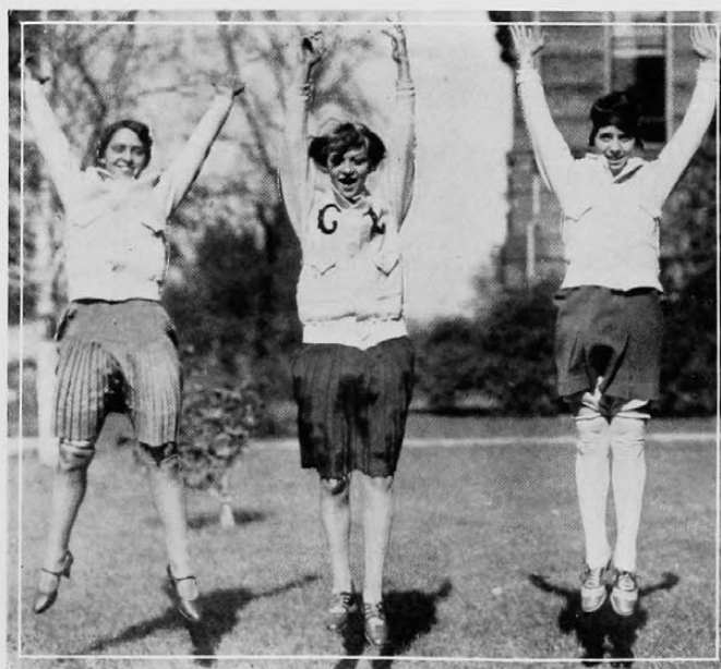
Pep! Everyone Craves It

W HO would guess that these three demure maidens could utter such shrieks and go through such maneuvers. But here is proof of it. And they really root!