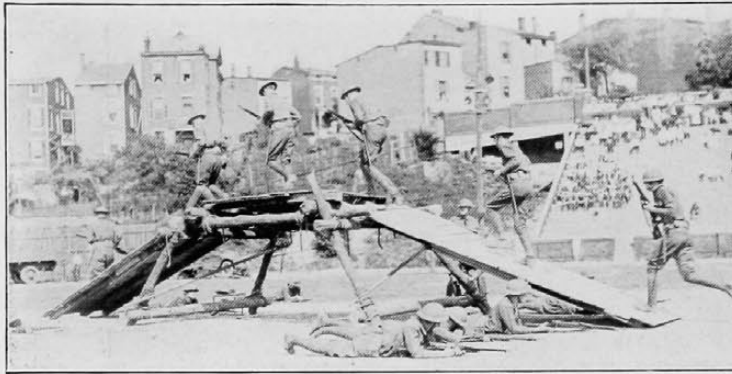
Covering a Retreat