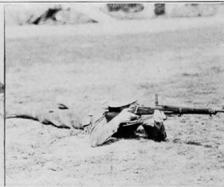
A Lone Sniper