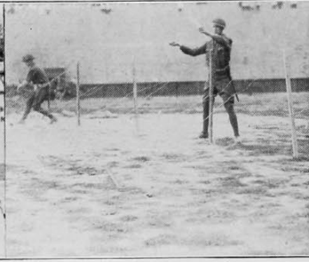
Stretching Barb-Wire Entanglements