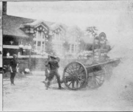
75's in Action