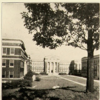
THE ENGINEERING QUADRANGLE