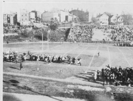
Tug o' war